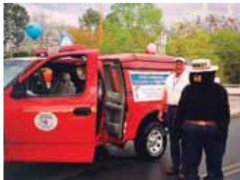
TOP - City of Sevierville bi-fuel CNG/gasoline Ford F-150 BOTTOM - Sevier County Utility District bi-fuel F-150 (LPG/gas)

Sevier Countians are another example of a county-wide effort toward alternative fuels. In addition to biodiesel, county municipalities are already using compressed natural gas (CNG) and have plans to begin using propane and hybrids as well.