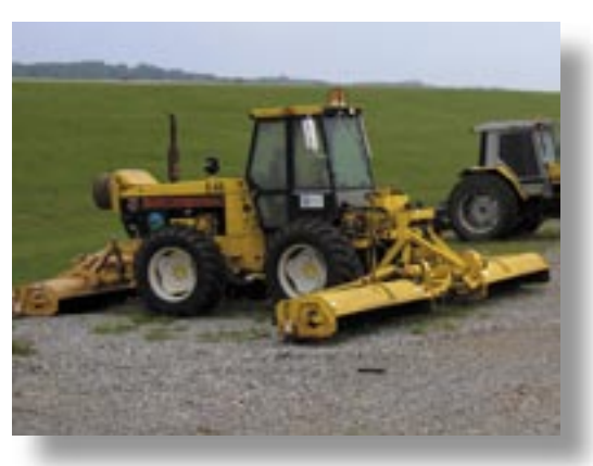
One of the tractors that Metropolitan Knoxville Airport Authority is testing a biodiesel blend in.

The project works from looking at today's airports, which are in many respects inefficient and costly to operate, to a simplified system that uses more automation. The project includes possible hybridization of airplanes, too.