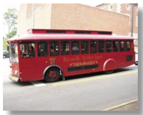
This is one of KAT's trolleys that operates around the downtown Knoxville area. All of the diesel trolleys, and another 70 diesel KAT vehicles, are now running on B20. KAT has recently received national accolades for their hard work on improving their transit system on all fronts.