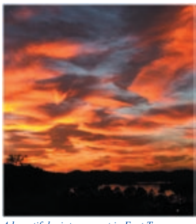
A beautiful winter sunset in East Tennessee.