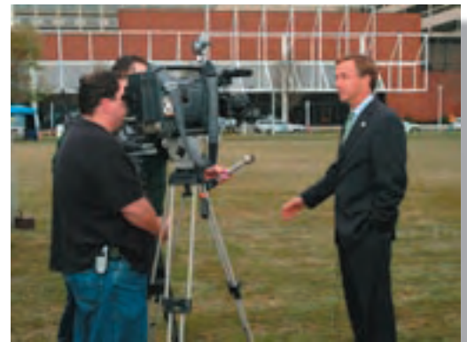
Knoxville Mayor Bill Haslam talks to the media during the Odyssey. He noted the importance of our actions to clean air in the community.

About 150 people came by to see the array of AFVs or test drive a GEM electric car or the Segway Human Transporter. There were games like the "Wheel of Clean Air" and the "Energy Independence Frisbee Toss" to accompany the fine food offered at the hot dog stand.