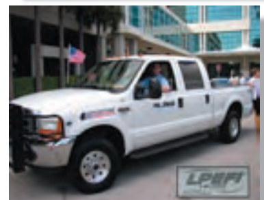
Vehicles from the National Conference as modeled by Fortner and Overly (top-to-bottom):

See the ETCFC Web site for updated information on what 2005 AFV models will be offered (look on the "AFVs" page).