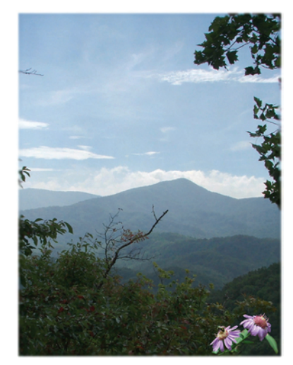
A view of a ridge in the Smokies from the Laurel Falls Trail.

"It just seems like the time to act with all that is going on around us," notes Taylor. "It's a simple step for us... it allows us to take action for local change."